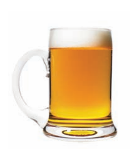
BEER OR WINE COOLER

If you know how much alcohol is in a "standard" drink, you can figure out how much alcohol you consume. Each of the drinks pictured below contains about the same amount of alcohol. But the amount of alcohol in some drinks can vary. For example, some mixed drinks have more than one "shot" of liquor. Keeping track of how much alcohol you take in can help you cut down.